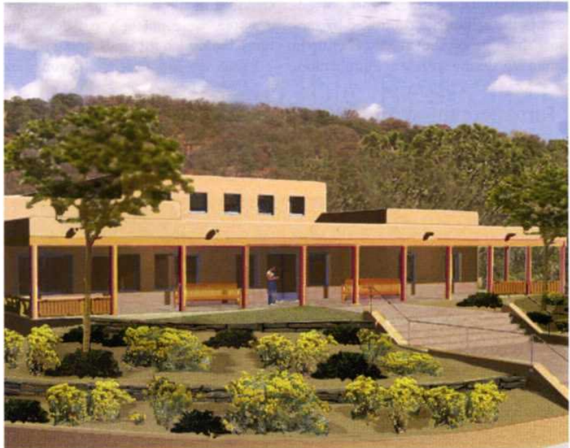
An anonymous donor paid for the environmentally-conscious design of the school's new library. Rendering courtesy Spears Architects

The tubes offer no view of the sky but have neither the bulkiness nor potential heat loss of large skylights. >>