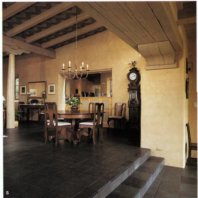
1) The master bedroom upstairs, with its views west toward the Jemez. 2) The main entrance features crushed gravel, natural foliage and a deeply recessed doorway. 3) Corian countertops in the kitchen. 4) The sun-splashed, south-facing front entry, which opens to a flagstone patio. 5) Stepping up into the living/dining area, one notes the mud plaster walls and the patterned, hand-painted ceilings.

Built by Tony Ivey and Associates, the Spanish Pueblo Revival house is constructed of cast pumice-concrete. That’s a relatively new building material that compares favorably, especially in price, to traditional adobe. The floors are mainly slate, the walls mud plaster, the ceilings fir beams with pine decking. Befitting the spirit of arty Santa Fe, the ceilings were hand-painted by the home’s owner.