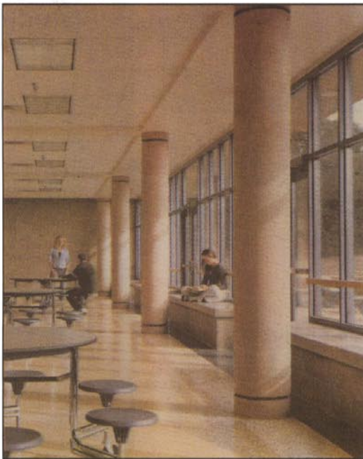
A Spears-designed interior space at Santa Fe Preparatory School

"We will not do houses larger than 5,000 square feet," Spears said. "It's kind of an arbitrary cutoff but very large houses use too much building materials and require a lot of energy for maintenance, and they tend to be eyesores on the landscape."